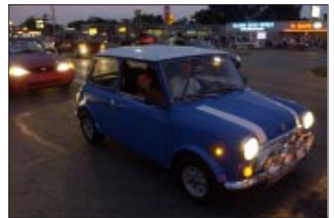
This Mini was one of a handful of LBCs actually cruising Woodward.