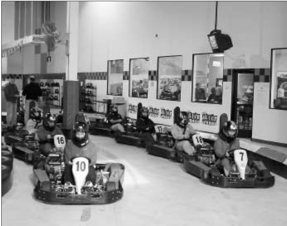
Drivers sit in their karts awaiting the signal to start their laps.