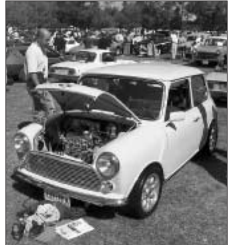
Have a Mini? Want to jazz it up? Here's some ideas to help you in your efforts!

of the lights, wipers and de-misting fan whilst permitting them to 'pack up' when a sensor detects bad weather.