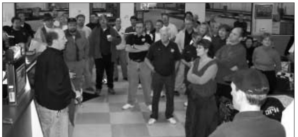
Pre-race drivers meeting