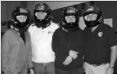
Four big pages of DTSC Kart 2 Kart coverage begins on front page.