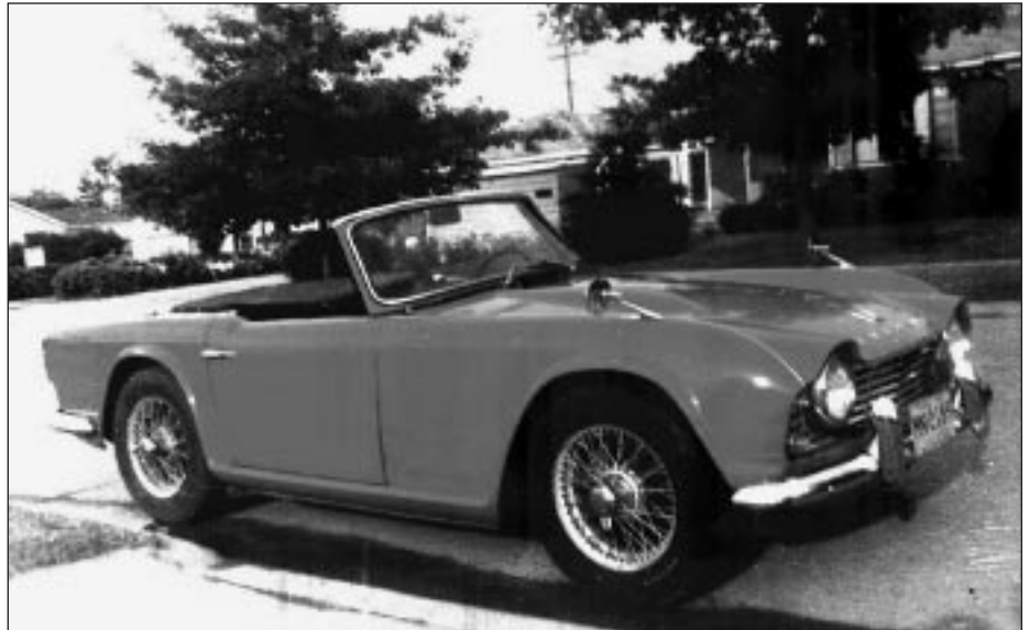
It took just one night of driving for Mike Simon to learn to smoothly shift his 1963 TR4.

In 1965, just prior to graduating from high school, I started looking for a good, used Triumph TR-4 in the want ads. We found one at a used car dealer on the west side of town, a red 1963 TR-4, black